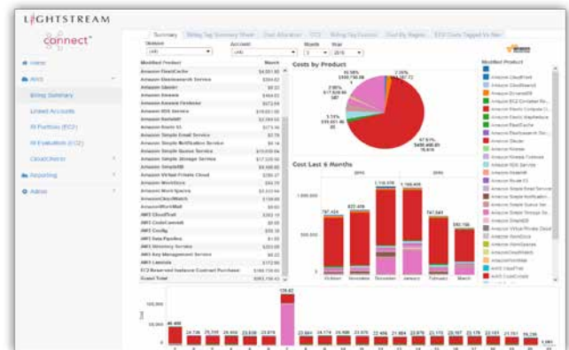
View detailed graphs and reports showing how your cloud resources are allocated.